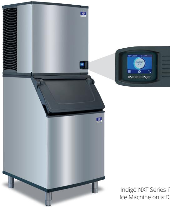
Indigo NXT Series iT0900 Ice Machine on a D570 Bin

Model: IRT0900A IYT0900A IDT0900A IRT0900W